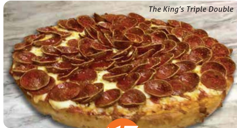
The King's Triple Double