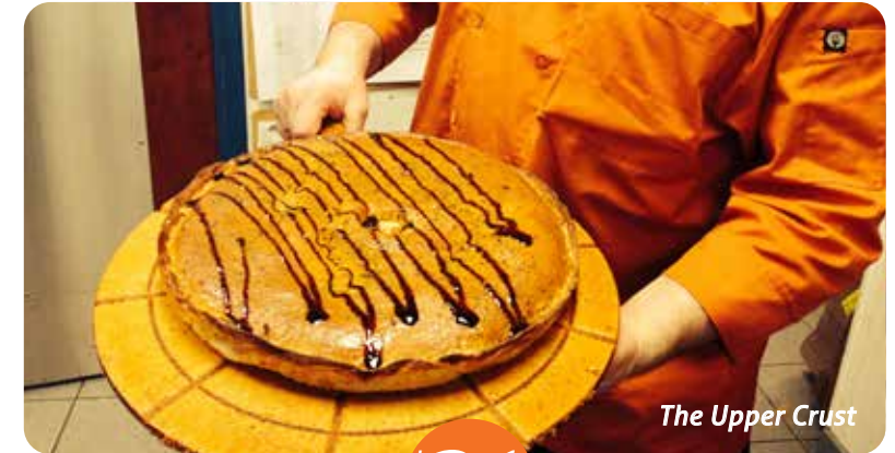
The Upper Crust